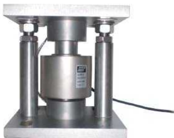
Stainless, use with HB-DCP Series

HB-MT 102-0.5t~50t (Alloyed Steel) HB-MT 102SS-0.5t~50t (Stainless Steel)